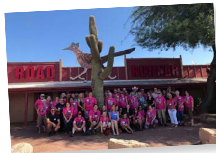
NO BAR TOO FAR 2018